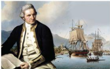
Captain James Cook

Here are some more explorers of the high seas that we are going to learn about.