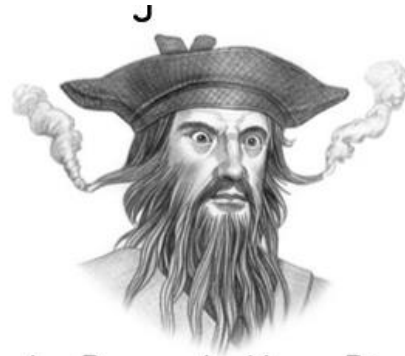
Black Beard the Pirate